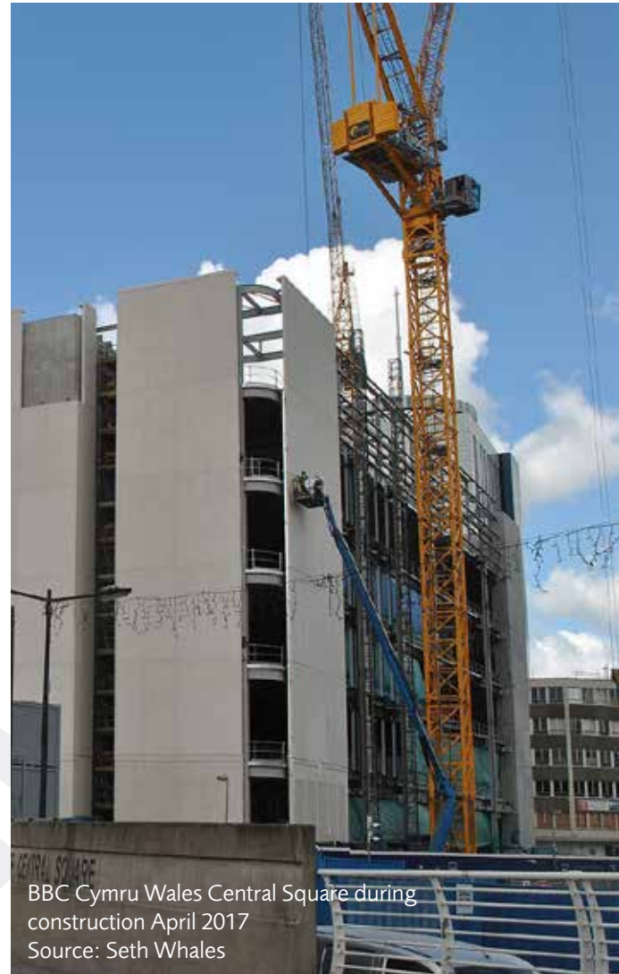
BBC Cymru Wales Central Square during construction April 2017

Austin also supported us with continuing professional development opportunities, to help candidates refresh their competences and meet the CPD requirements. Over the Christmas holidays, the first 15 candidates submitted their applications and in early 2020,