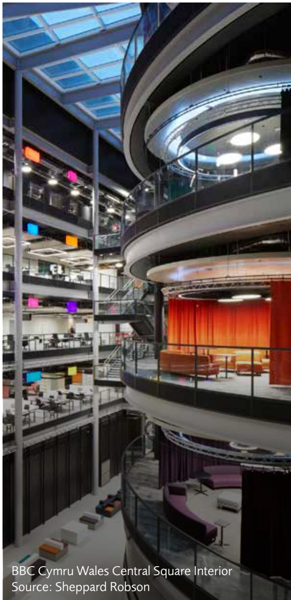
BBC Cymru Wales Central Square Interior

The first successful candidates were notified at the end of March, a second batch in May and a third in August. We now have 18 ChPP accredited staff, representing all areas of the BBC, from Design and Engineering, TV and Radio Content, News, Finance and Operations.